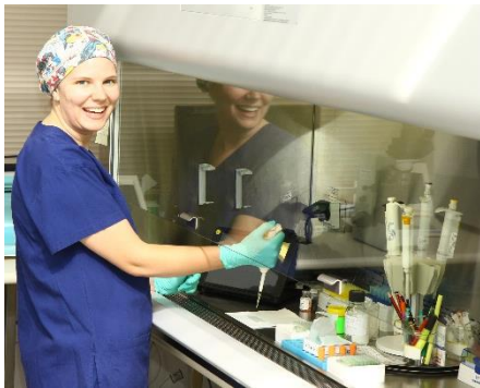
The iPad has become a part of the daily equipment HFC's andrologists use

In case the WiFi goes temporarily off, all data is saved locally and transferred to the server as soon as the connection is established again.