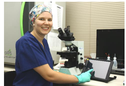
The iPad has replaced a paper-based system at HFC's lab

Lateral was assigned to develop a custom iPad app, tailor-made to the lab's workflow. We worked closely together with HFC's andrologists, analysed their daily workflow and involved their feedback in the app development process.