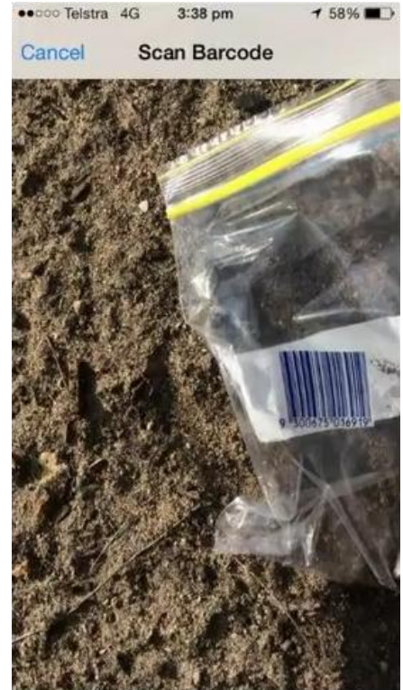
Samples are scanned via barcode scanner using the phone's camera

Lateral was asked to develop a custom iOS app for CSBP called "CSBP Sampling Pro". The farmer uses the free app on his iPhone or iPod touch, scans the barcodes affixed to the NUlogic kits' sample bags while GPS