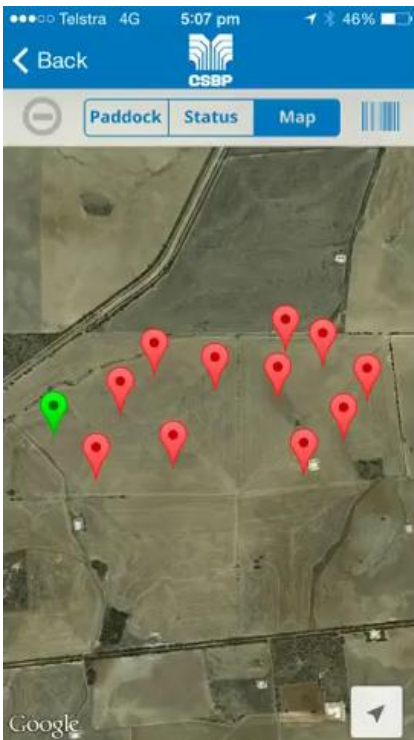
The App records GPS data when soil sample packs are scanned at various locations in the paddock

information is automatically collected. On Google Earth, he can see where in the paddock the sample has been collected. Red markers indicate not complete samples, turning green when they have been completed. Existing sites can be imported, allowing to pre-plan their locations and delegate the collection work of sampling to staff. Users enter the paddock information before sending all information via the app to CSBP's laboratory.